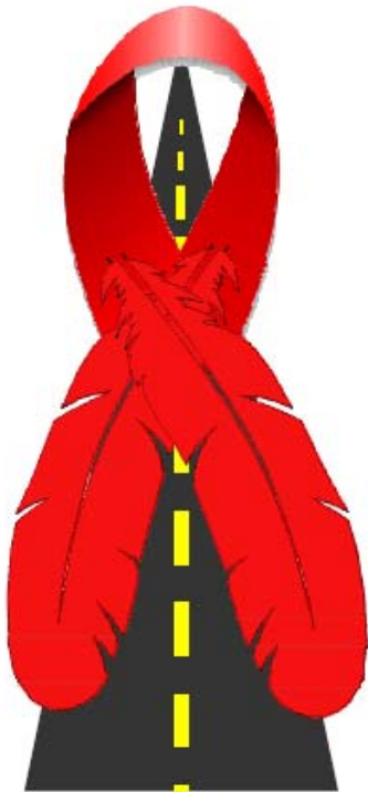
Toolkit for Integrating HIV Services in Native Health Settings